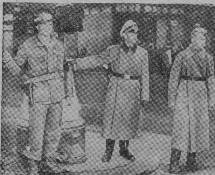
An American MP, a civilian policeman and a Russian MP patrol what little traffic is left in the once gay city of Vienna.