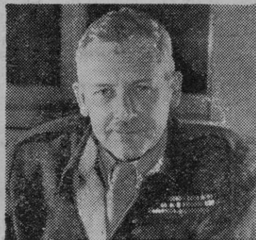
Lt. Gen. Sir Frederick Morgan

The Air-France Paris-Bordeaux mail plane crashed Sunday night in a fog after hitting a church steeple at Bruges, seven miles north of Bordeaux. The bodies of the pilot, radio engineer and mechanic have been found in the debris. Mail bags were scattered over a wide area.