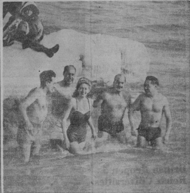
Five members of the Milwaukee, Wis., Polar Bear Club take their annual dip in Lake Michigan, while the thermometer registers 16 degrees above zero.