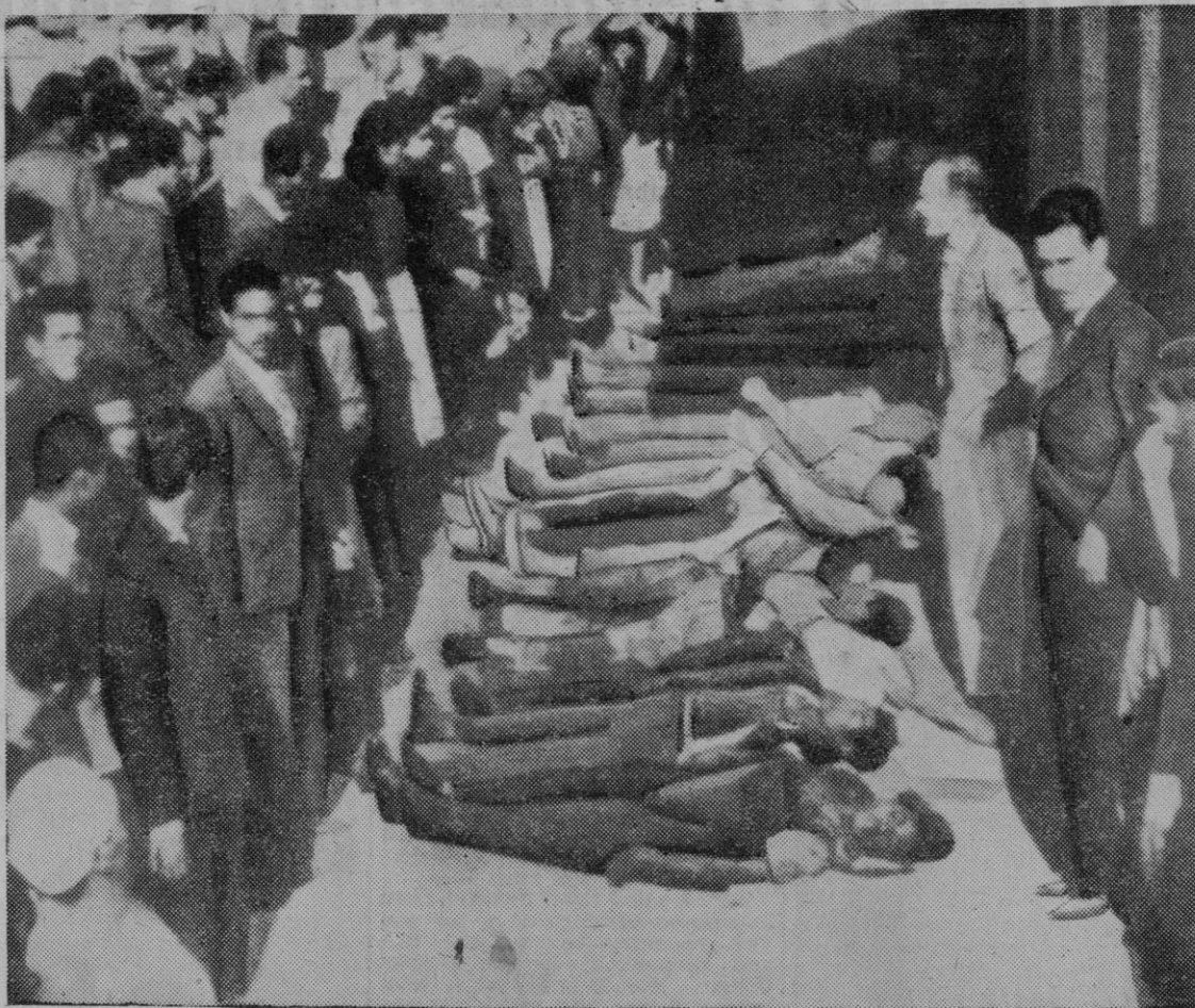
A crowd in Leon, Mexico, looks upon some of the 25 persons killed when Mexican troops and police fired on demonstrators at a political meeting. Thirty-three persons were wounded.