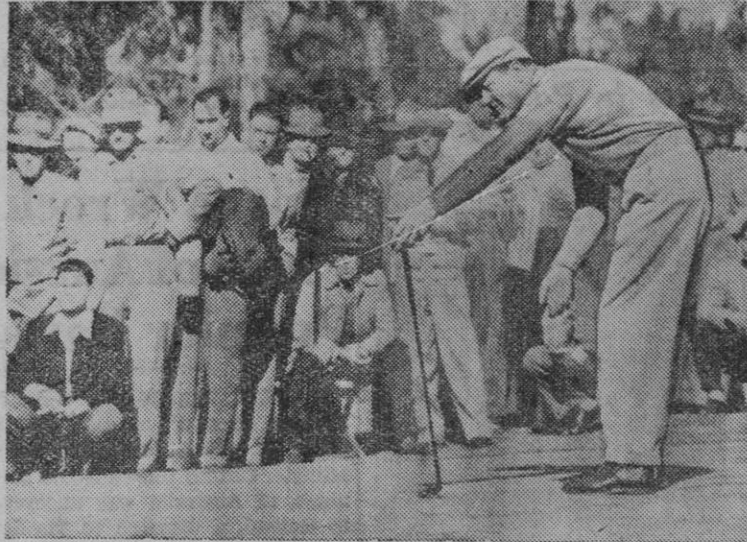
Lord Byron Nelson, last year's leading money winner and victor of two tournaments this year, watches his ball intently as it misses the cup on the 12th green of the $10,000 Los Angeles Open.

Ben Hogan, currently Nelson's most serious rival, settled for third-place money of $1,500 by posting a 293. Combined with the $1,866.67 second money he captured in the Los Angeles Open last week, Hogan ranks second in the winter money standings with $3,366.67.