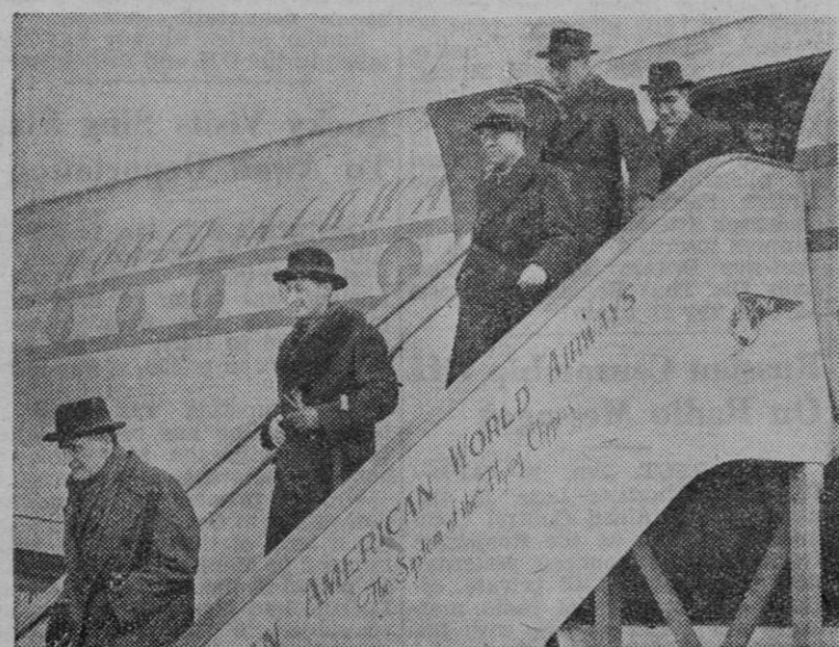
The committee seeking a permanent UNO site arrives in N.Y.