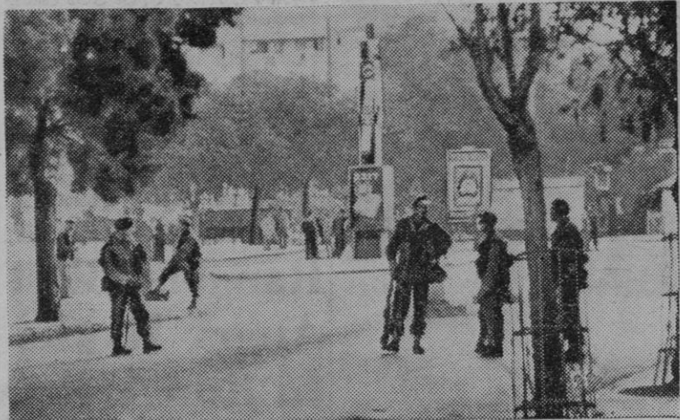
British troops patrol a square in the city of Tel Aviv.