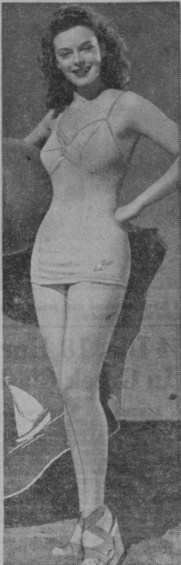
This is Marguerite Chapman. Further words are unnecessary.