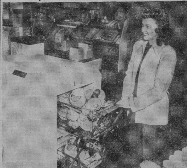
Fruit, vegetables and groceries bought in this Spokane, Wash., market can be freed of germs by passing the grocery basket through this device, which contains ultra-violet lamps.