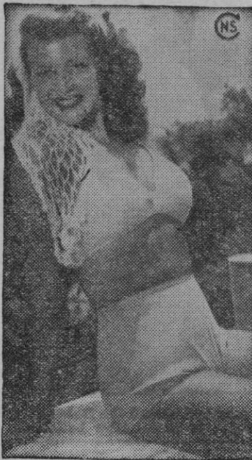
The alleged sweater Rita Hayworth is wearing is made from a fishnet. Sounds fishy, but take a good look.